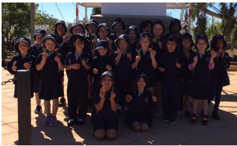
Our primary students visited our war memorial and placed rosemary on the monument as a mark of respect.