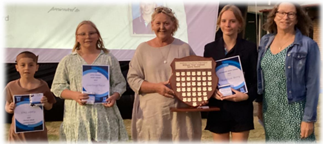
At Southern Cross District High School, our staff and students 'Strive' to achieve their personal best.