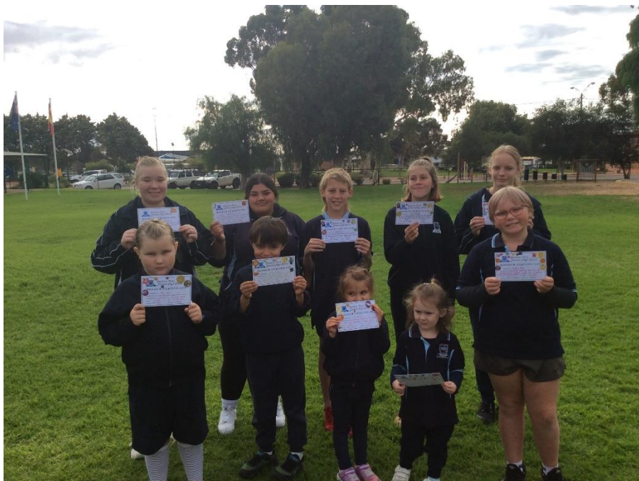
At Southern Cross District High School, our staff and students 'Strive' to achieve their personal best.