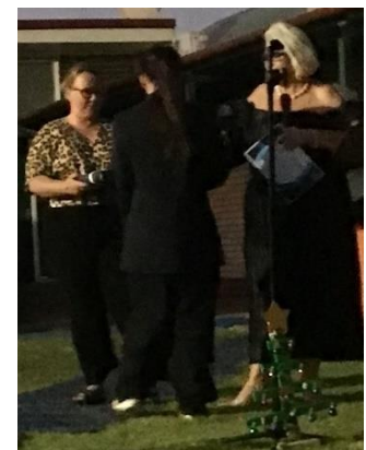
At Southern Cross District High School, our staff and students 'Strive' to achieve their personal best.